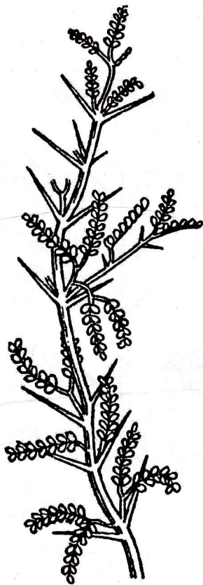
PORTION OF SHOOT OF PROSOPIS